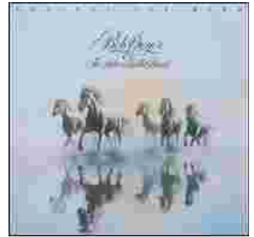
Album: Against the wind (1980)