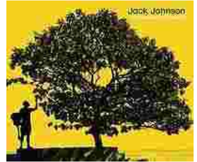
Album: In Between Dreams (2005)