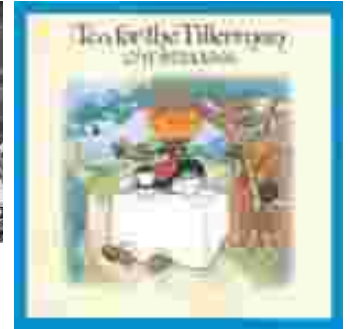
Album: Tea for the Tillerman (1970)