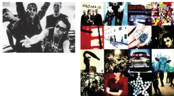
Album: Achtung Baby (1991)