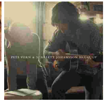
Album: Break Up (2009)