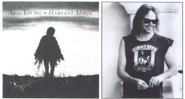
Album: Harvest Moon (1992)

On peut le jouer aussi en accordant la 6 (E) en D, l'accord Em est modifié